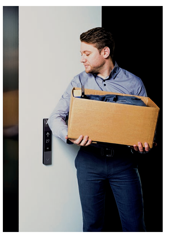
Large, clear landing call buttons for ease and convenience.